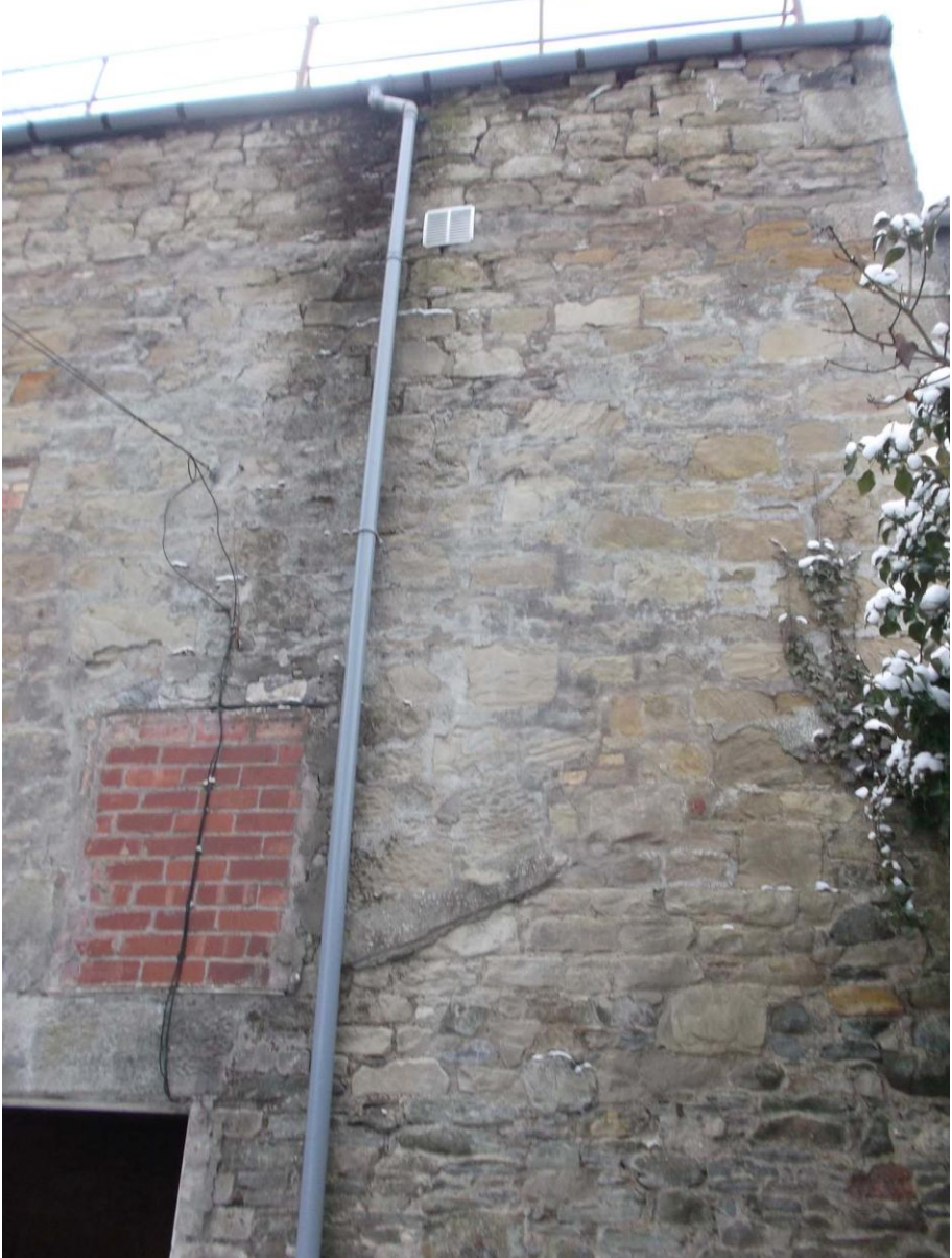
Photograph 5 – view of northeast elevation (blocked opening visible)