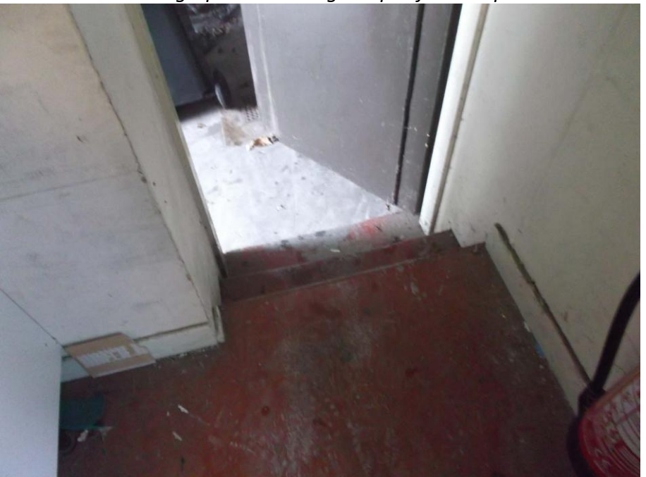
Photograph 7 – existing fire escape steps to be altered.