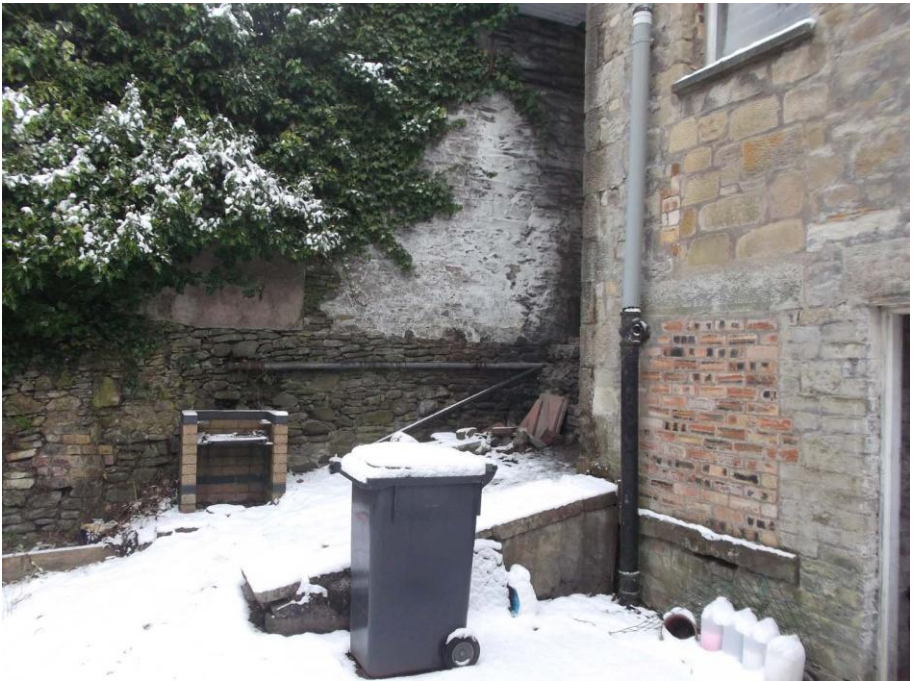
Photograph 2 – View of northeast elevation and existing ramp