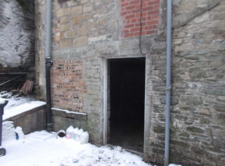
Photograph 3 – view of northeast elevation and door to basement (blocked openings visible)