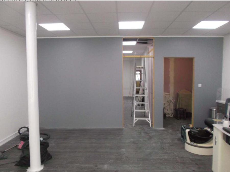
Photograph 8 – View from within shop unit towards rear area proposed for change of use – central doorway to be separating/ access door