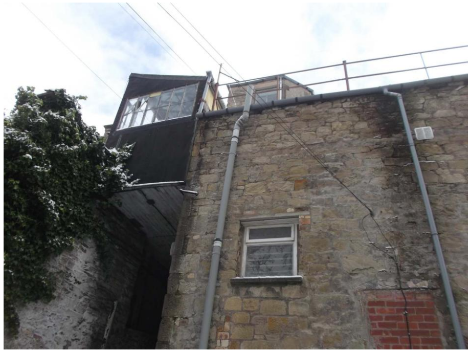
Photograph 1 – View of northeast elevation