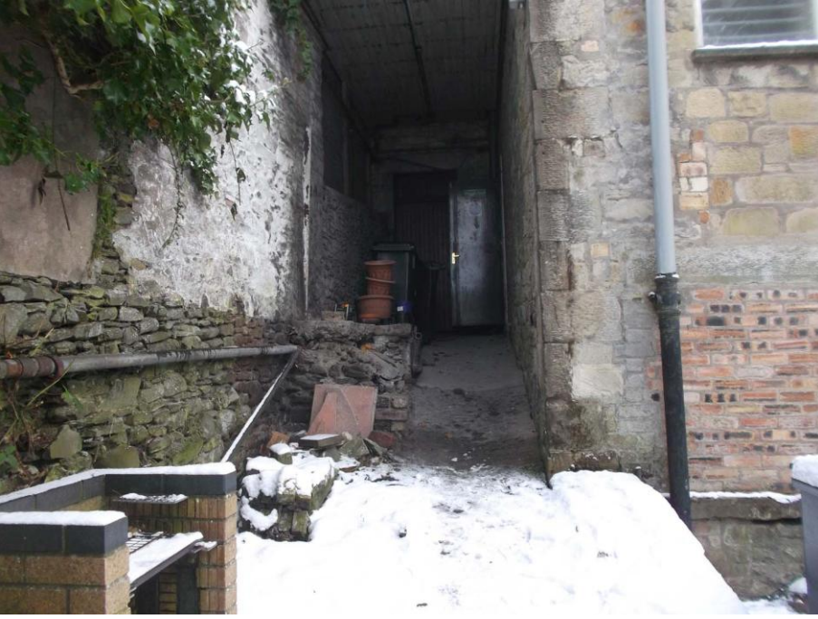
Photograph 6 – existing ramp & fire escape