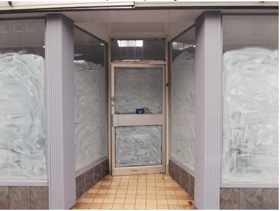
Photograph 9 – existing street door/ level access