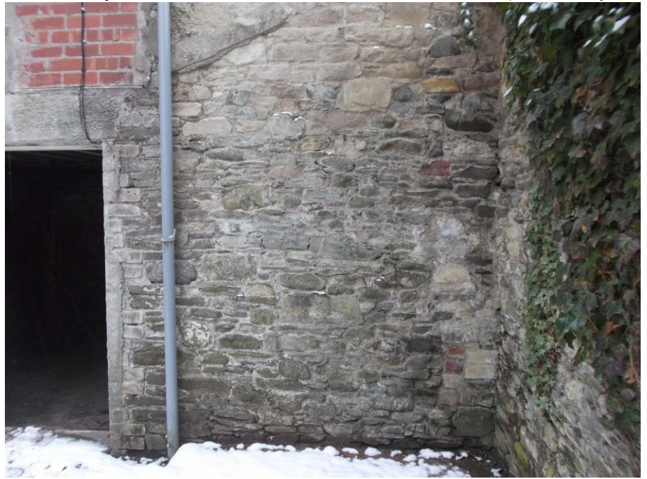
Photograph 4 – view of northeast elevation and door to basement (blocked openings visible)